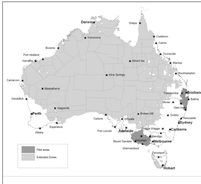
Figure 3 40